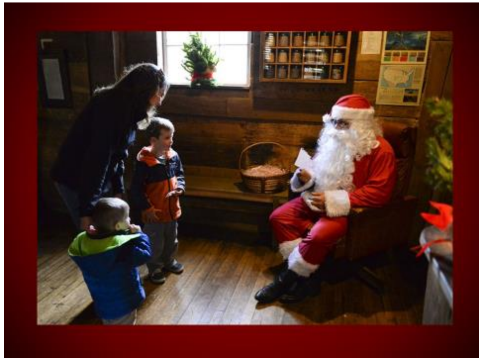
a) @ Bonneyville Mill county park