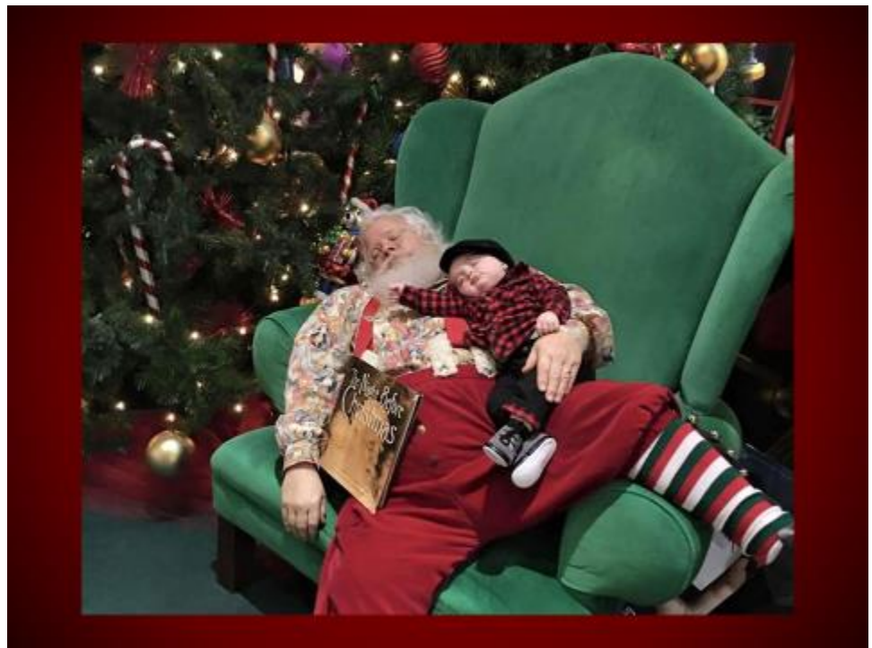
c) Farther south in Evansville, this little toddler & Santa apparently both fell asleep!

3. Now cutesy Santa Claus pictures are something we may expect to see at this time of year, but I hope we would agree that someone dressed in a Santa suit is NOT the personal appearance that matters most @ Christmas.