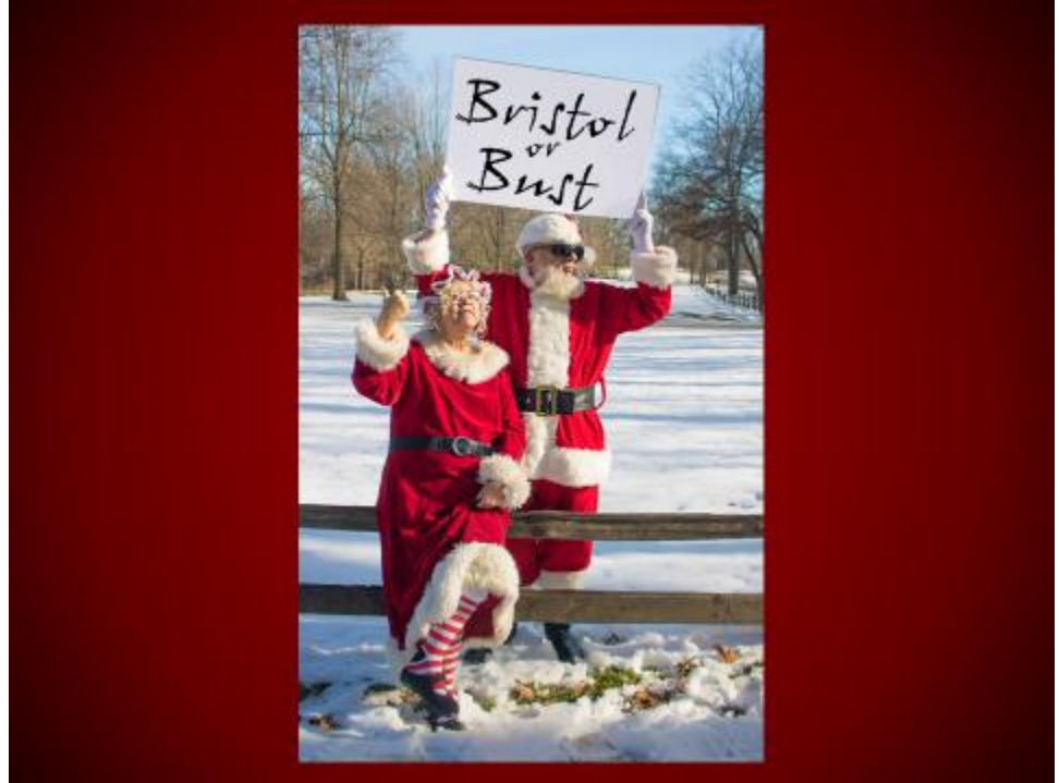
b) Another one with Mrs. Claus on their way to Bristol